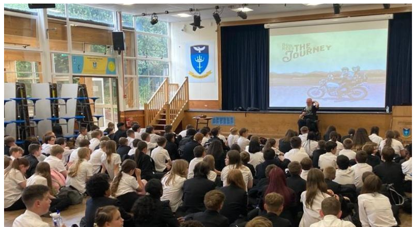
Speaking to students about life and living with a disability.