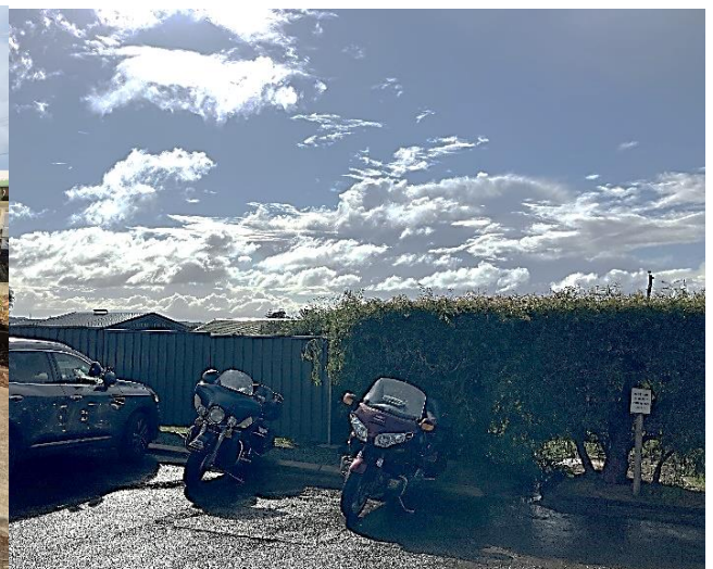
Phil waiting for other keen riders- What! Only Chris and me. Well let's be off then!

Wednesday 24th July ride to Cheyne's Beach. Two riders took the challenge, sun shining at the Information Bay, sunshine at Cheyne's Beach.