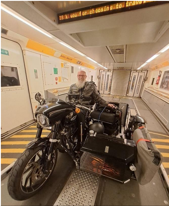
Travelling on the Eurorail under the English Channel.

So rather than miss the opportunity to write about this, I'll write a brief summary.