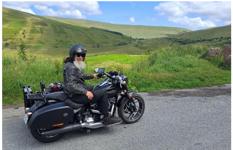
Brecon Beacons, South Wales.