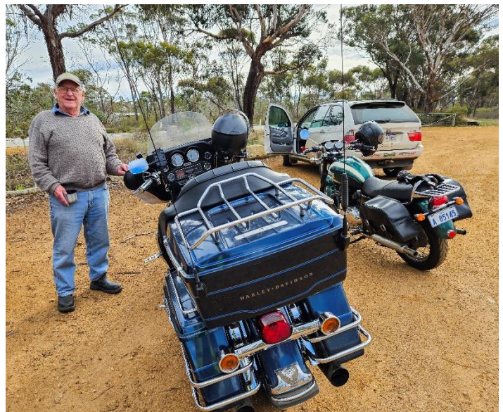
Warwick beside my new bike.