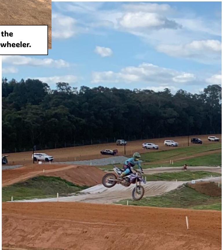
Riders flying high over the new track. Below- View across the complex- shows club houses at the rear.