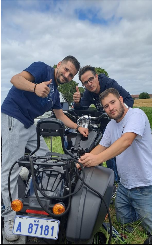
Helping with dead battery, France. ↑ One armed friend near Narbonne. He rode to the Isle of Man on a modified Sportsbike. ↓