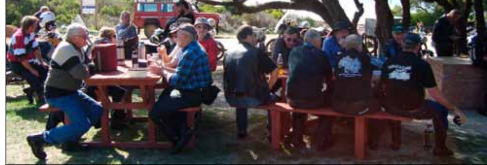
Picnic spot at Parry's Beach.

There was a couple who used to live in Perth, but were now in Queensland standing looking at the bikes coming in. I said "Hello" and they were saying that they have quite a few bikes, and only recently sold an Ariel Square 4 -