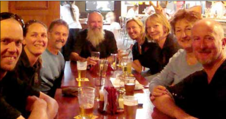
Friday night dinner in a pub in Bunbury.